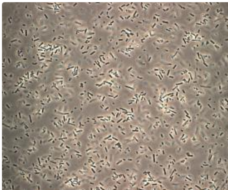
Figure 1: Beer spoilage microorganisms – what no brewer wants to see under the microscope!