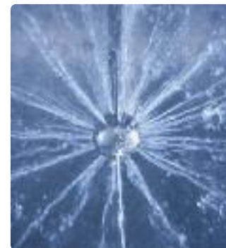
LEFT: Fig 4: Spray pattern from a high pressure low volume rotary jet.