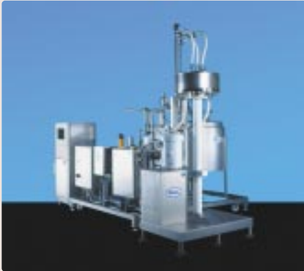
Figure 6: A single 'head', 40m 2 , Pallsep Vibrating Membrane Filter (VMF) for crossflow filtration of yeast up to 18 hl/hr