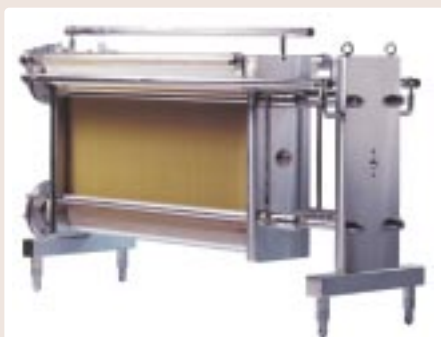
Figure 11: A DSS M39-H Alfa Laval plate & frame polymer membrane crossflow filter capable of handling 35 hl/hr yeast slurry

This is determined by the quality of filtrate/centrate and policy of the brewer. Some brewers add beer back to the whirlpool or into the wort stream just before wort cooling. This can be successful as long as