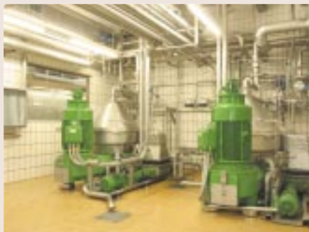
Figure 12: Picture of two large Westfalia SC 150 disk bowl centrifuges rated up to 600 hl/hr suitable for a yeast dose back operation

there is no yeast in the filtrate which will be autolysed by the hot conditions. The hot environment also has a pasteurising effect. This type of operation is not as straight forward as it seems, because recovered beer is not always produced in synch with brewing.