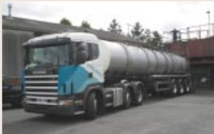
Figure 2: A 44-tonne tanker delivering 28 tonnes of yeast to a pig farm in the UK