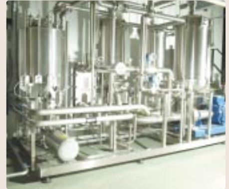
Fig. 9 - A Filtrix CERinox ceramic crossflow filter. The photo shows a 3 module plant, with each module of 40m 2 capable of handling up to 18 hl/hr of yeast slurry – photo supplied by Filtrix AG.

The main advantage of crossflow is, that due to the very small pore size of the membranes (typically 0.5-0.8 microns), the filtrate is close to bright beer quality, virtually yeast free, has good palate and physical parameters. The membranes are ceramic or polymer, and installations can be completely automated. With the VMF (using PTFE membranes) most of the energy applied to separate beer from yeast comes from the vibration of the membrane. This means that very little pumping energy is needed to