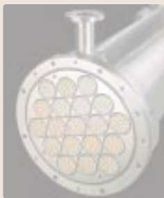
Figure 10: Filtration module from a ceramic cross flow filter – Photo supplied by Filtrix AG.

‘on-line’ process with little extra equipment, especially if green beer centrifuges are already in use. However there are a number of considerations: