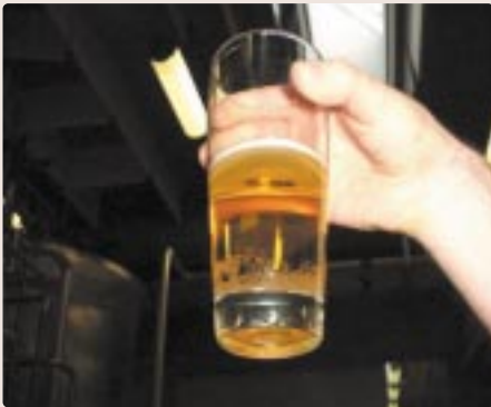
Figure 7: Bright beer quality filtrate from yeast slurry processed on a Pallsep VMF.