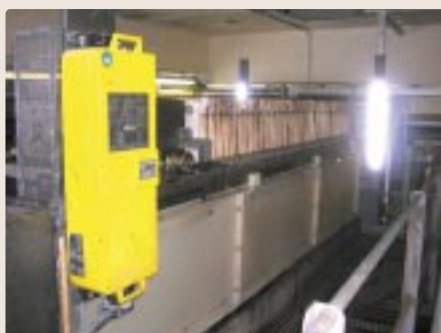
Figure 1: A one tonne yeast press in a British brewery with polypropylene plates and frames installed in the 1980s.

c) The running costs continued to rise, and the