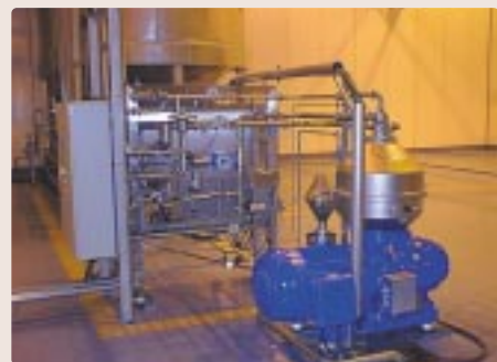
Figure 5: A FEUX-510 Alfa Laval continuous discharging nozzle disk owl centrifuge (yeast processing rate 20-80 hl/hr)