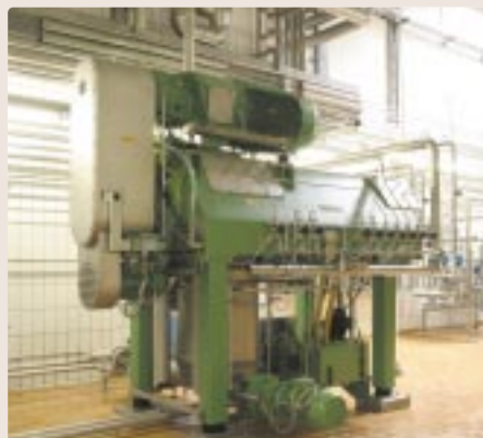
Figure 4: A Westfalia CB 506 decanter centrifuge for processing up to 40hl/hr of yeast

The 'squeezing' element from the decanter screw, is thought by some to cause damage to the yeast cells. The centrate does have high yeast counts and some brewers have a small clarifying centrifuge and flash pasteuriser in line after the main decanter centrifuge, to ensure quality is assured before beer is returned.