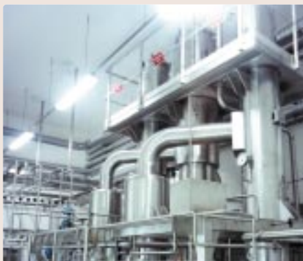
Figure 3: A GEA-Wiegand 20hl/hr falling film alcohol evaporation plant for recovering alcohol from brewery yeast – photo supplied by GEA-Wiegand.

Some brewers will decide that they do not want to return any recovered beer for quality reasons. These breweries will increasingly have to address the problem of where and how their surplus yeast will be disposed of in